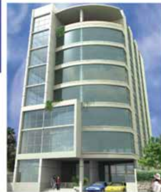
B1 + G + 8 Storied