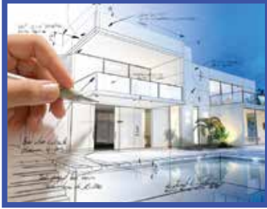
ARCHITECTURAL AND MASTER PLANNING