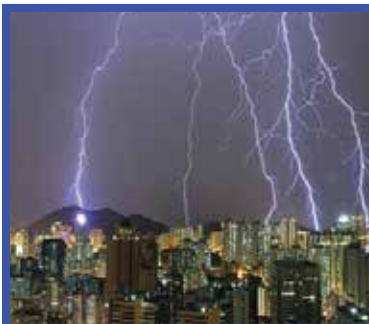
LIGHTNING PROTECTION SYSTEM (LPS)