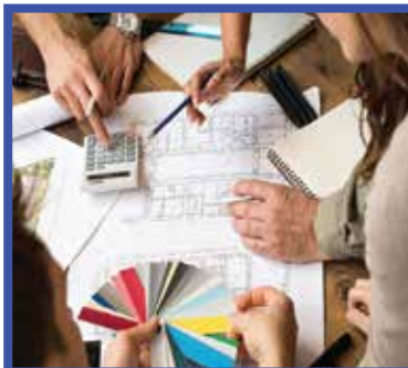
PROJECT MANAGEMENT AND SUPERVISION