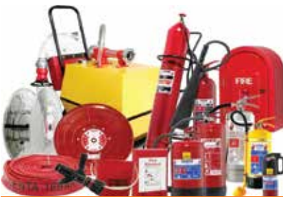
Fire - Equipments