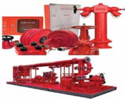
Fire Hydrant & Sprinkler System