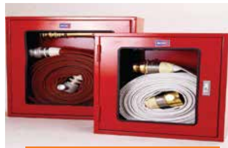
Hose Pipe System