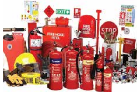
Fire & Safety Equipments