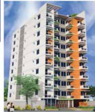
B2 + G + 9 Storied