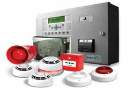
Fire Alarm System