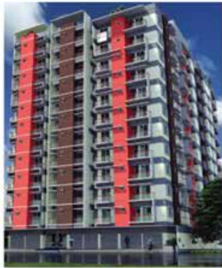
B2 + G + 8 Storied