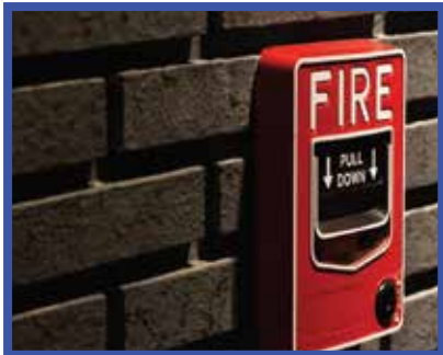
FIRE SAFETY SOLUTIONS