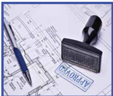
RSC, RAJUK PLAN APPROVAL