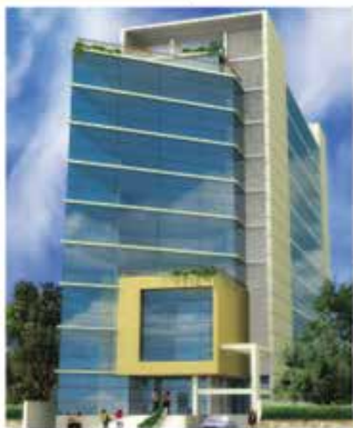
B1 + G + 6 Storied