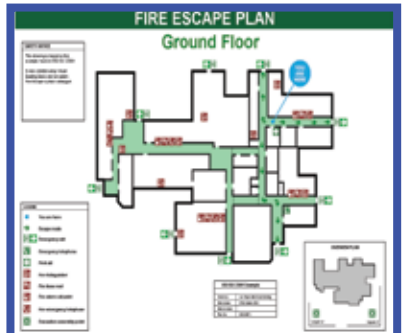
FIRE SAFETY WORKING & PLAN APPROVAL