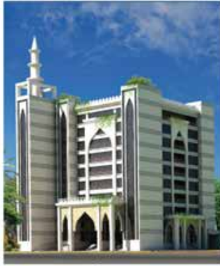
B1 + G + 10 Storied