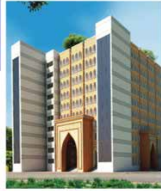
B1 + G + 10 Storied